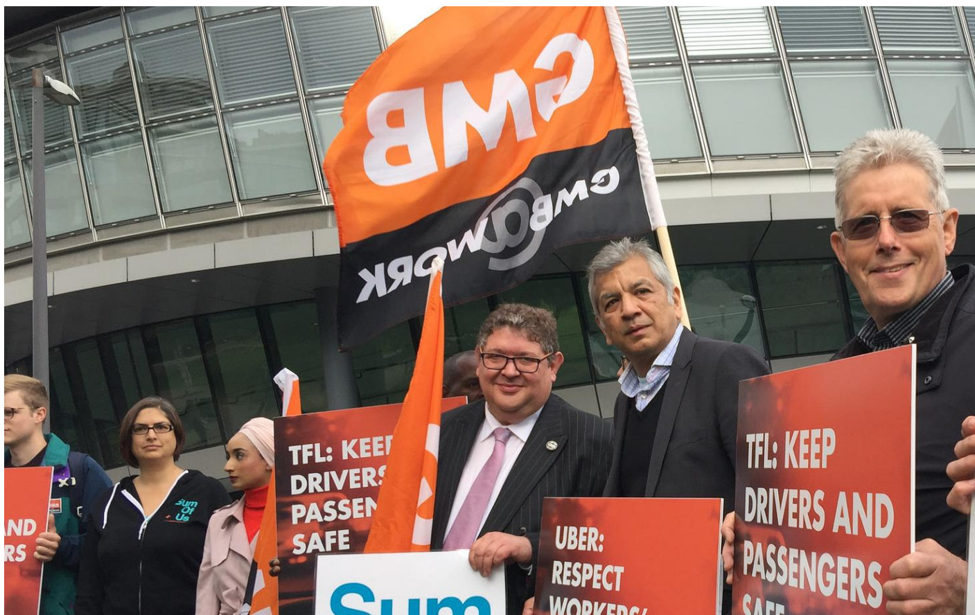
Uber drivers in London protest exploitation and poor treatment.